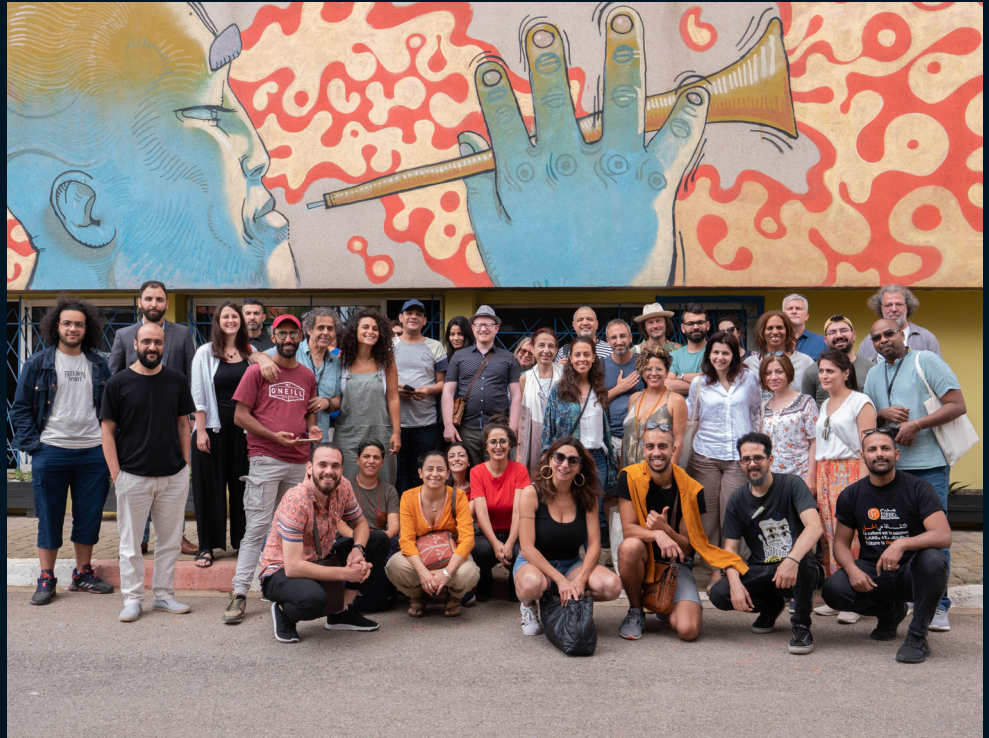
Artists making change in the Middle East and North Africa